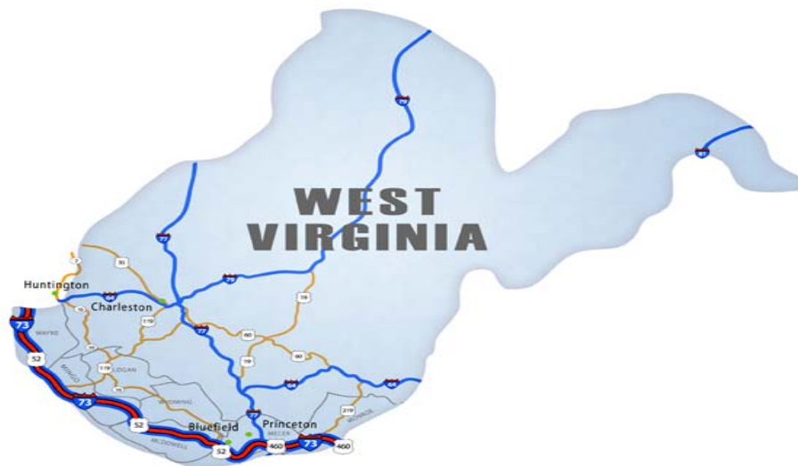
Figure 2.1: I-73 in West Virginia

In 1994, the West Virginia Department of Transportation (WVDOT) conducted the King Coal Highway Purpose and Need Study , which concluded that there is a need for the King Coal Highway. The study found that the King Coal Highway would enhance both regional and local system linkage, would improve access for emergency services and community services, and would enhance employment opportunities in the region. 4 In 2000, WVDOT completed the King Coal Highway Final Environmental Impact Statement . This study evaluated different alternatives, including a “No Build” alternative, and recommended a preferred alternative (PA) route based on “...its ability to best facilitate the project’s Purpose and Need while minimizing impacts to the natural, physical, and social environment.” 5 In 2000, the Federal Highway Administration issued a Record of Decision (ROD) on the King Coal Highway. 6 The Federal Highway Administration approved the PA route so the design and eventual construction of the King Coal Highway could proceed.